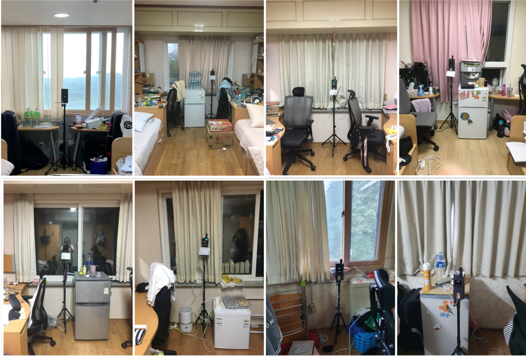
Fig. 1. Configurations of the dormitories with an ESM device installed in the middle

designed to encase the components and to emulate standard smart speakers. This assembled smart speaker was placed on the height-adjustable stand, as the speaker required additional height adjustment for an unobstructed view of the entire room from the camera lens. During data collection, the speaker was located at the center of the room near the inner wall with its height adjusted to eye level to accurately detect movements within the whole room.