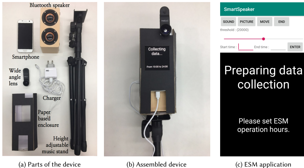
Fig. 2. Smart speaker device for data collection

turn-takings (bi-directional interactions). At an orientation before data collection began, we explained to the participants this meaning of proactive services and provided them with the following three example scenarios (based on three popular services of Amazon Echo [3, 4]):